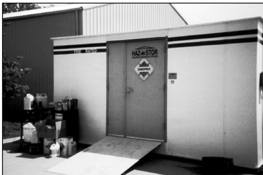
Hazardous Materials Collection Facility

One gallon of oil can contaminate 1,000,000 gallons of water.